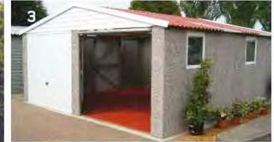
Opposite: Apex Spar Double 5.79m (19'0") wide with vertically ribbed white powder coated steel doors. 2. Apex Spar 2.74m (9'0") wide with personnel door. 3. Apex Spar Double 5.18m (17'0") wide with optional terracotta coloured roof sheets, PVCu windows, PVCu fascias, translucent roof sheets and white vertically ribbed up and over doors. 4. Apex Spar 2.74m (9'0") wide with red granular steel tiled roof, PVCu fascias and opening window plus vertically ribbed up and over door and personnel access door. 5. Apex Textured Magnolia 5.79x6.15, (19'0"x20'2") with white PVCu fascia.