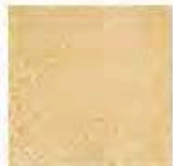
Textured - 4 colours