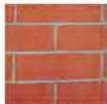
Deep Red Brick