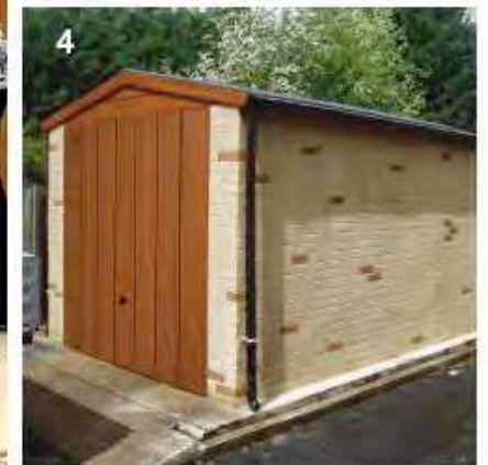
Opposite: Premier Brick Red Brick 2.74m (9'0") wide with Cedar up and over and personnel doors and terracotta Roof sheets. 2. Premier Brick Buff brick with rosewood PVCu window and personnel door. 3. Premier Brick Red Brick with Georgian style door and white PVCu fascia. 4. Premier Buff Brick with Golden Oak wood grain finish door and fascia.